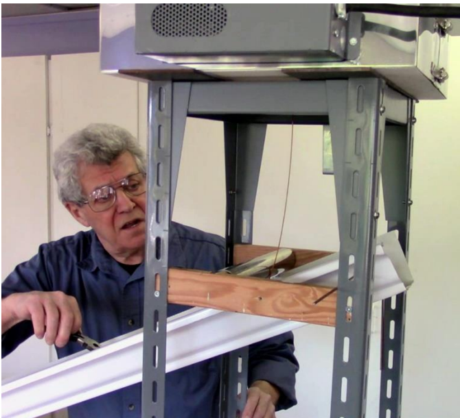
Pulling soft glass along an aluminum rain gutter to draw out long uniform thickness stringers.