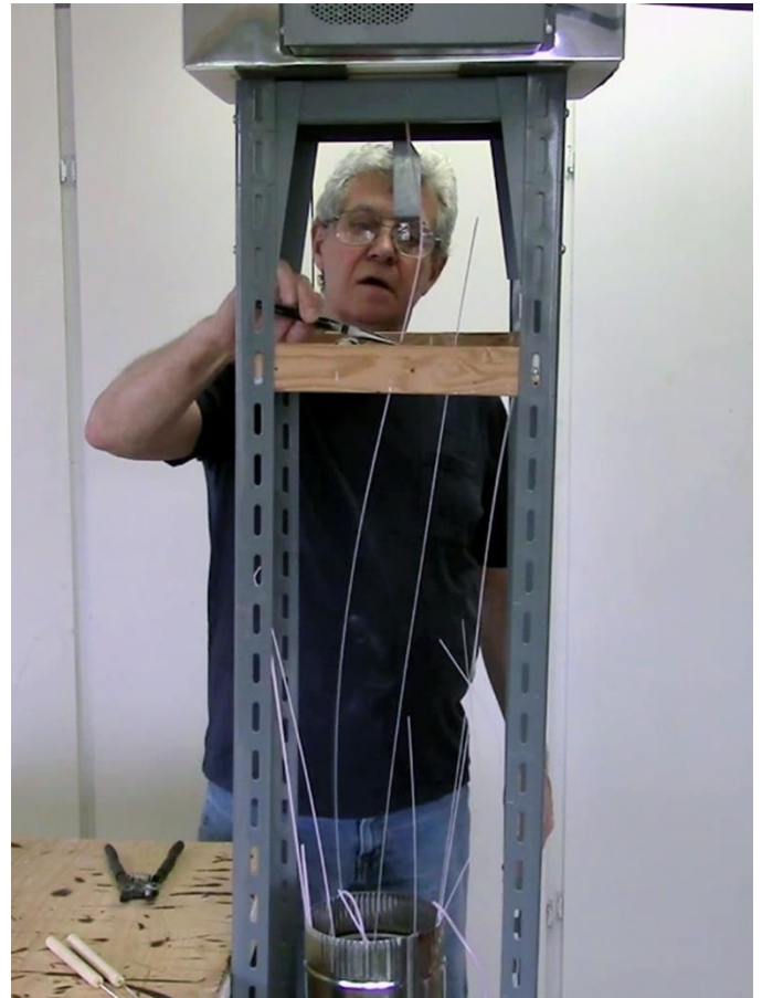
Kiln with stand bolted to 6 ft tall metal angle bar. Dropping stream of glass into a piece of stovepipe is a great way to make long straight stringers.