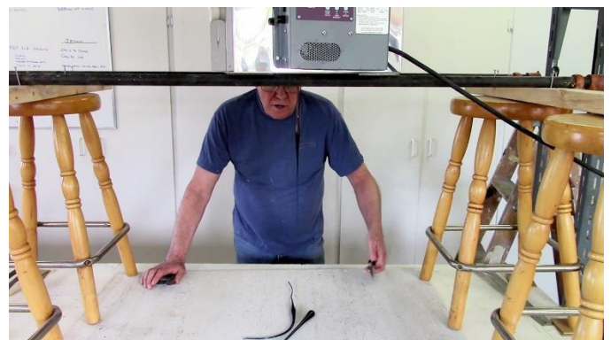
Kiln on steel pipes spanning wooden stools.