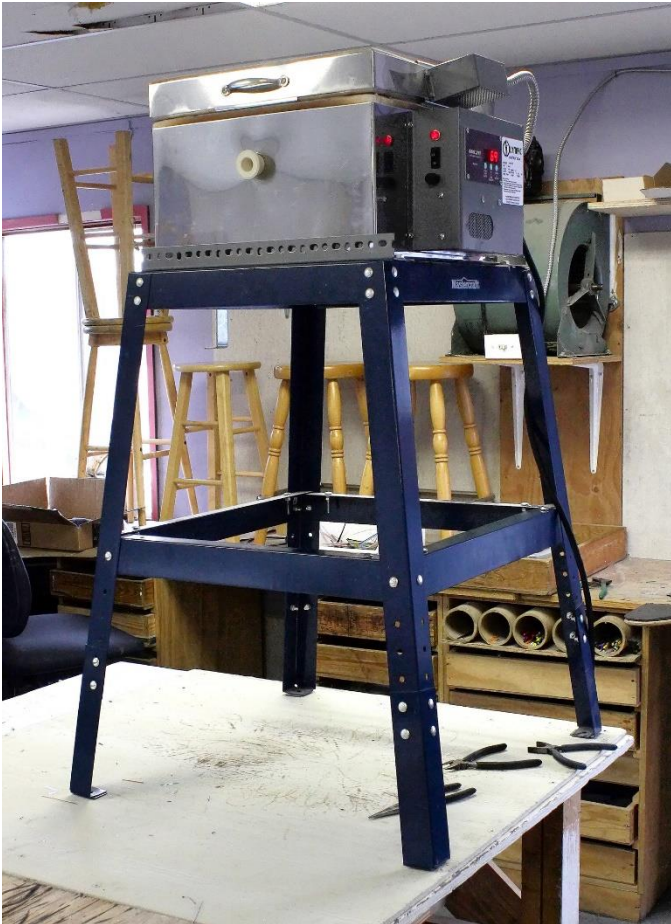
Kiln on metal stand designed for a table saw. It's sitting on a piece of fireproof cement board.

Standing your vitrigraph on a table gives you the option of either letting the melt drop down onto the table or drawing it out along the table.