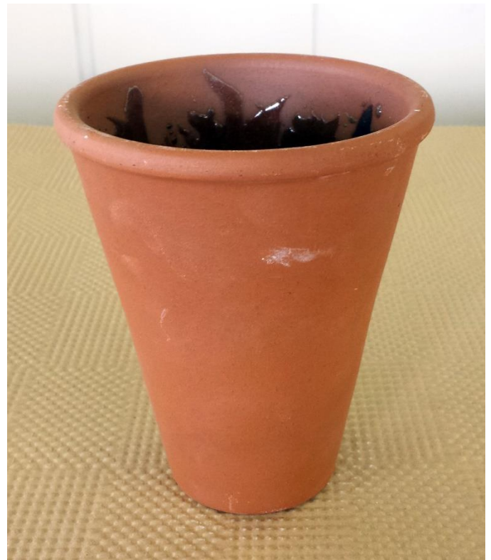
2.5 cup capacity narrow base earthenware pot. This shape pot have proven to be reliable for more than a dozen resuses.

Earthenware pots are inexpensive and work well for melts but those made from low quality clay are highly susceptible to cracking when fired full of molten glass. Avoid any from Mexico or China. The best are from Italy and can be reused multiple times.