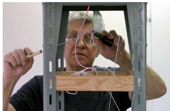
Manipulating the soft stream to