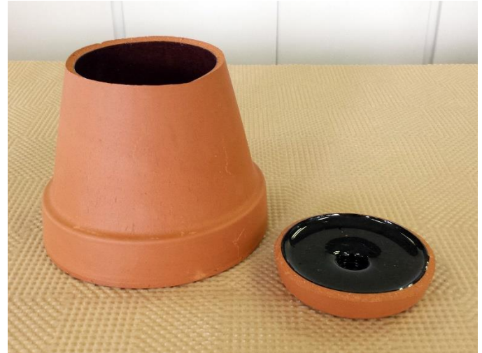
Earthenware pot cracked after one use

Tall thin pots will cool more safely than low wide ones. You can just turn the kiln off and let it cool naturally if you use a tall thin pot but should program it to cool down at about 400F degrees per hour if you used a wider shape pot. A wider bottom pot will retain enough glass to retain heat on the bottom of the pot which can cause a thermal shock crack as the sides of the pot cool. The best is a ceramic pot curved inside but with a flat bottom outside to hold the pot firmly in place during the melt.