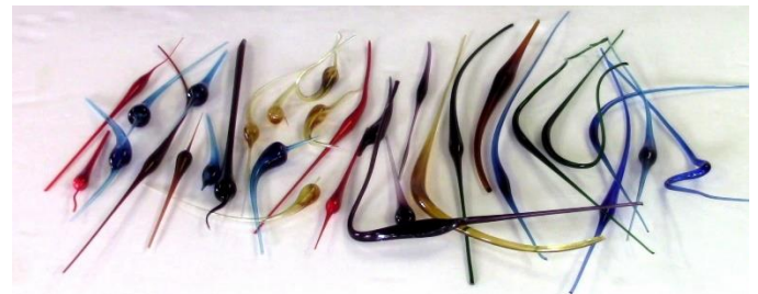
Torpedo shapes created by alternating between allowing a thick melt to build up and drop from the pot followed by a drop stream of stringer.

With a bit of practice you can make your own rods and stringers whatever size you like but you can always buy rods and stringers. The special thing about a vitrigraph is how it can allow you to make shapes and forms you can't make any other way.