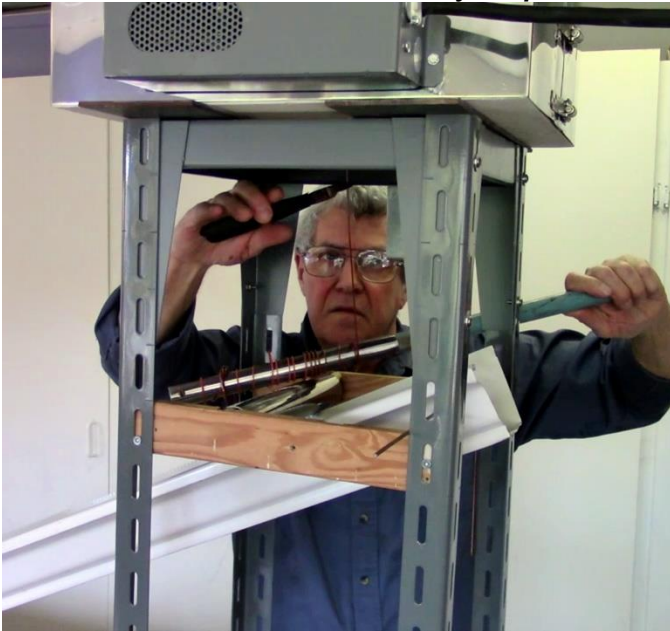
Winding soft glass around a metal pipe to create coils.