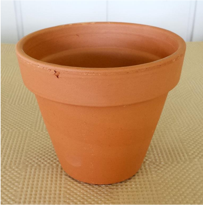
4 cup capacity wide base earthenware pot

Ceramic or porcelain pots are more likely to stand up to multiple firings than earthenware