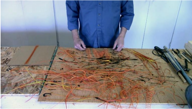
Glass dropped onto plywood. You can see the burn marks where the hot glass hit the wood.