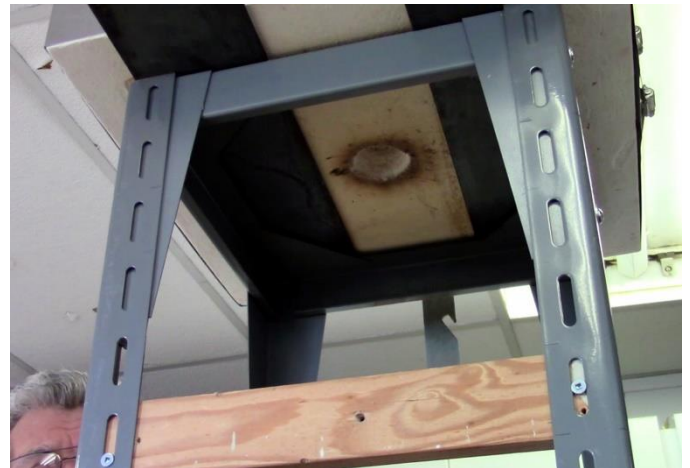
Kiln with hole drilled in its floor.

Making a vitrigraph is as simple as taking any kiln, drilling a hole in the floor and elevating it so you can work beneath it.